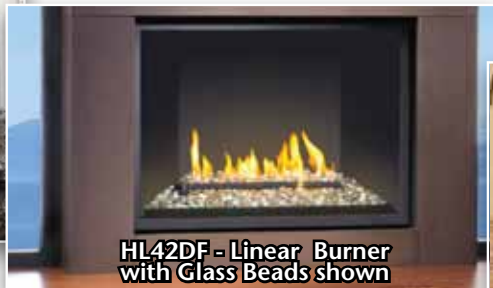
HL42DF - Linear Burner with Glass Beads shown