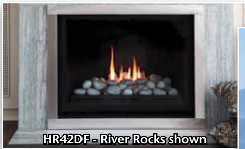
HR42DF - River Rocks shown