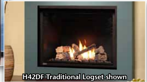
H42DF Traditional Logset shown