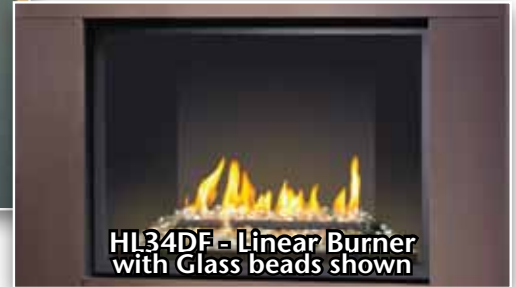
HL34DF - Linear Burner with Glass beads shown