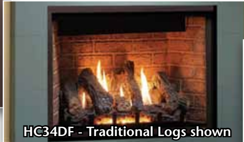
HC34DF - Traditional Logs shown