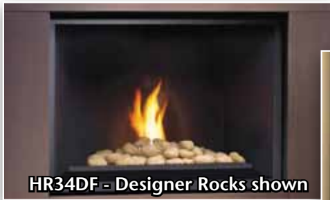
HR34DF - Designer Rocks shown